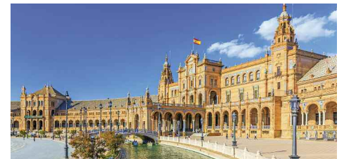
Plaza de España, Sevilla

Note: Itinerary may change due to local conditions. Walking is required on many excursions, and surfaces may be uneven or unpaved.