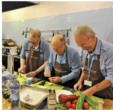
Catalán cooking class

Contemporary Catalonia. Many Catalans think of themselves as a separate nation from the rest of Spain. Learn about their continued search for independence from Spain.