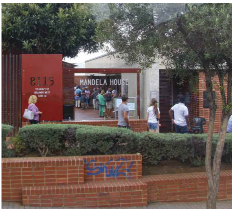
Mandela House, Soweto

Chobe National Park. Known for its elephant population, Chobe is ideal for spotting tusker herds. The Chobe River gives life to hundreds of animal, bird and reptile species that call the floodplains home. Explore the park during a full-day excursion, including a safari cruise.