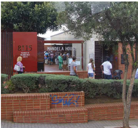
Mandela House, Soweto

Chobe National Park. Known for its elephant population, Chobe is ideal for spotting tusker herds. The Chobe River gives life to hundreds of animal, bird and reptile species that call the floodplains home. Explore the park during a full-day excursion, including a safari cruise.