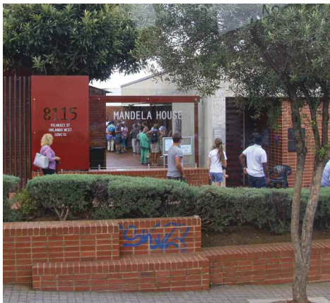
Mandela House, Soweto

Chobe National Park. Known for its elephant population, Chobe is ideal for spotting tusker herds. The Chobe River gives life to hundreds of animal, bird and reptile species that call the floodplains home. Explore the park during a full-day excursion, including a safari cruise.