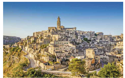
Sassi di Matera