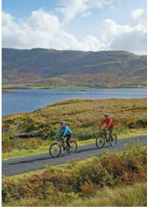
Great Western Greenway