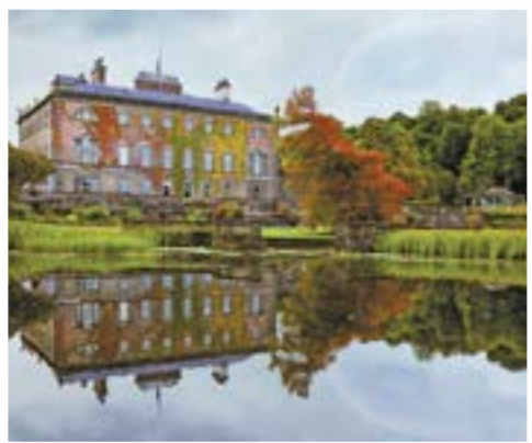
Above: Westport | Inset: Westport House

Discovery: Westport House. Explore the legacy of Grace O'Malley, the 16th-century Pirate Queen of Connaught, at Westport House. O'Malley's great-great-granddaughter and her husband built a home atop the ruins of one of the Pirate Queen's castles in 1650. Less than a century later, the family expanded the house to the grand manor house that exists today. Venture down into the dungeons to see remains of the castle.