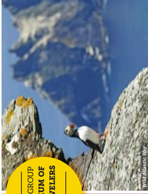
Wild Atlantic Way