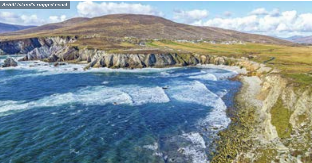
Achill Island's rugged coast