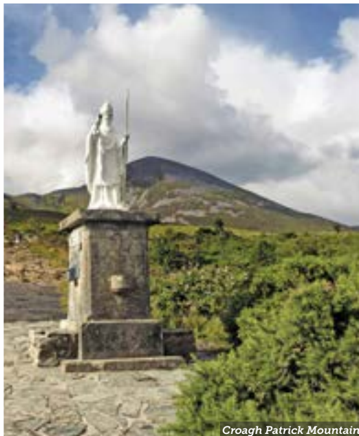
Croagh Patrick Mountain