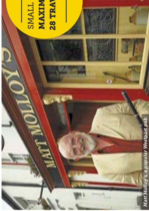
Matt Molloy's, a popular Westport pub