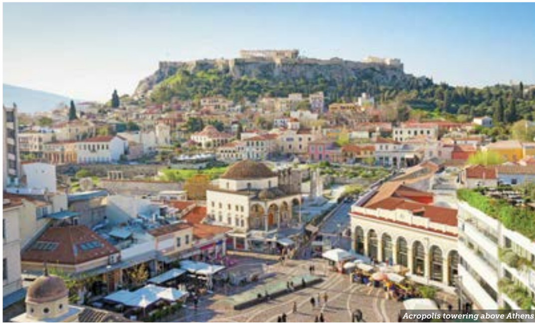
Acropolis towering above Athens