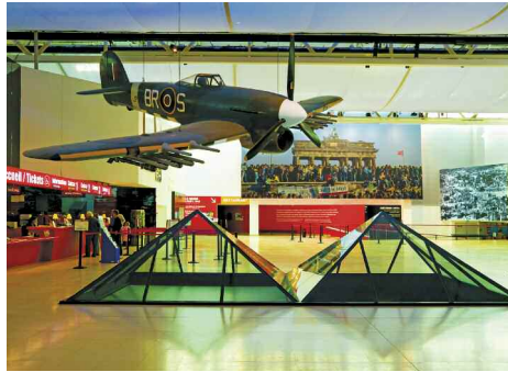
Caen Memorial Museum

D-Day and the Battle of Normandy. Discuss the role that Normandy and its citizens played during this crucial period of the Allied war effort.