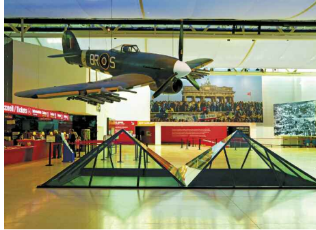
Caen Memorial Museum

D-Day and the Battle of Normandy. Discuss the role that Normandy and its citizens played during this crucial period of the Allied war effort.