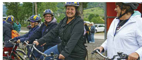
Biking along the Danube

Timeless Vienna. Discover the history of Vienna, an elegant and timeless city.