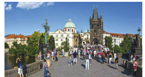
Charles Bridge, Prague