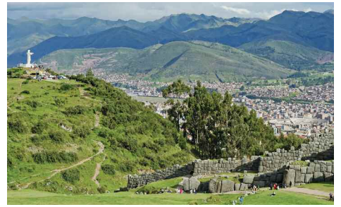
Sacsayhuaman Incan stone ruins

The information in this flier is correct at the time of printing. Please visit our website to ensure that you receive the most current information.