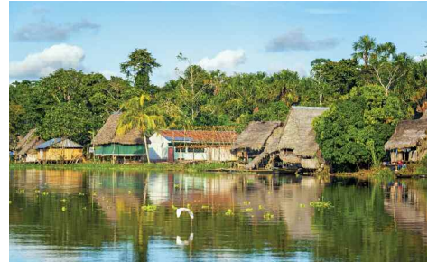
Yanayacu River Village