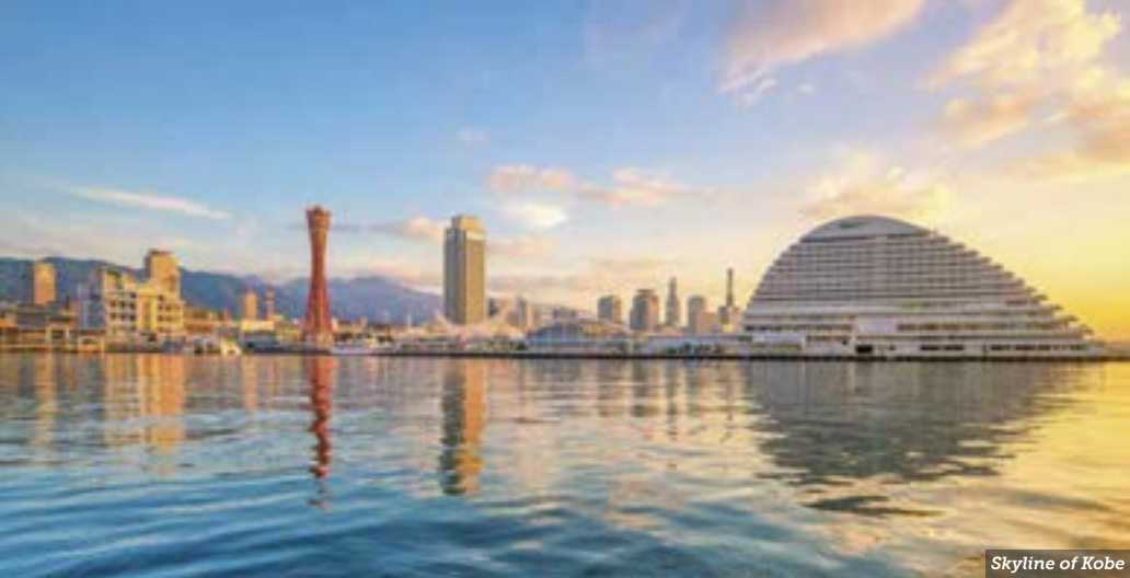
Skyline of Kobe