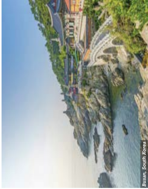
Busan, South Korea