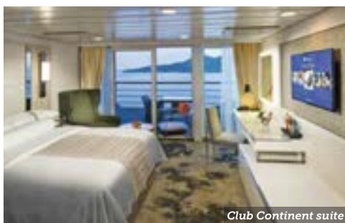
Club Continent suite