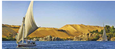
Feluccas on the Nile

We've meticulously selected the most gifted and professional Egyptologists. Warm and genuine, they're ready to share their passion for their country with you and answer your questions. At every stop, this expert will open your eyes to the depth and breadth of the country's history and make Egypt come to life for you.