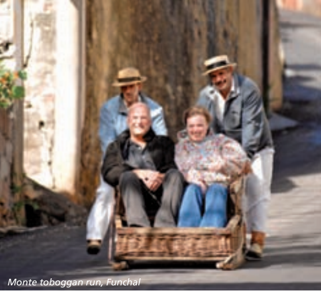
Monte toboggan run, Funchal

Presorted Standard U.S. Postage Paid AHI Travel