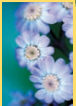
Above: Canary Islands Inset: Pericallis

In the 1400s, the islands became part of the Spanish Colony and it's been said that Christopher Columbus stopped here in 1492 en route to the New World. Many historians also believe this may be the site of the lost continent Atlantis. Today, travelers journey to the Canary Islands for its sheer beauty and natural wonders. Tenerife, the largest island, is home to a remarkable array of flora and fauna, a volcano, rugged coastlines, archaeological wonders, pristine beaches and bustling ports — which make it a favorite destination for visitors worldwide.