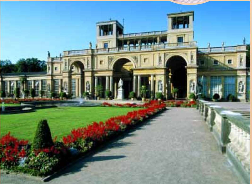
Orangery, Sanssouci Park, Potsdam