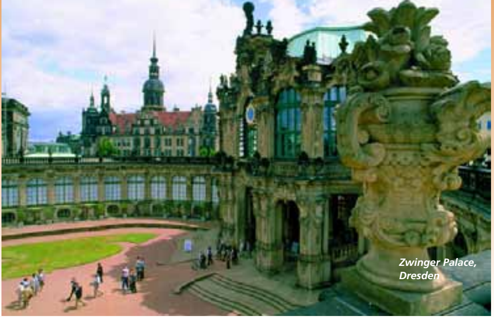
Zwinger Palace, Dresden