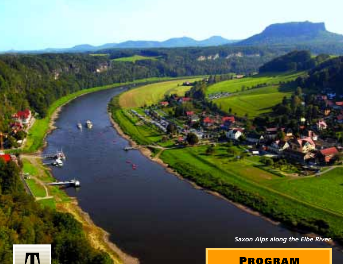
Saxon Alps along the Elbe River