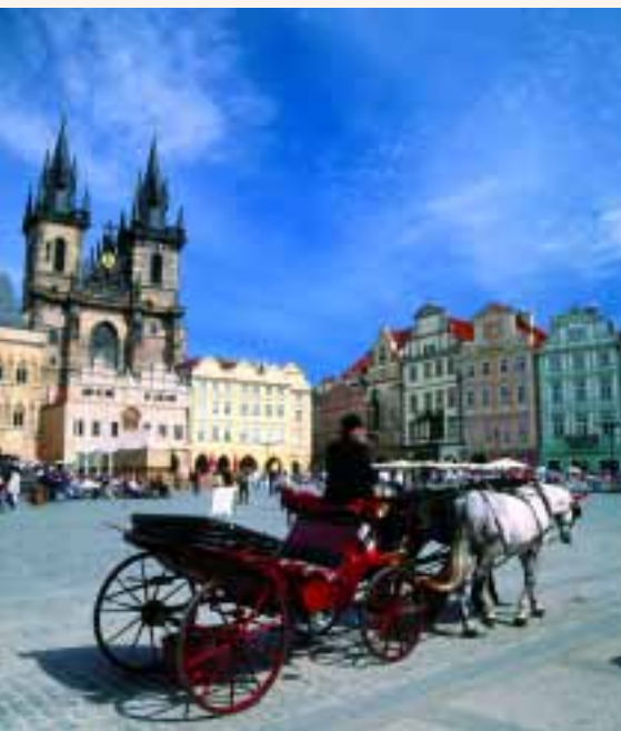
Tyn Church and Old Town Square, Prague

night when the buildings, towers and domes are illuminated. By day, the bridge teems with musicians and artisans selling their wares. The world's most ambitious example of high baroque architecture is St. Nicholas Church, which boasts a broad dome and slender bell tower. Perched above the city, Prague Castle is composed of structures that date from the 10th century. The castle's Gothic St. Vitus Cathedral is the spiritual heart of the Czech Republic.